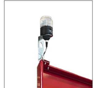
Signal tower incl. maximum indicator