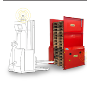
Prepared for AGV 15 pallet / 500 kg