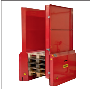
Safety frame with gate for 15 pallets