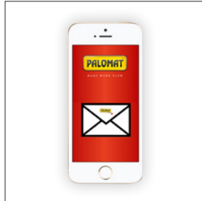
Prepared for information via SMS / E-mail