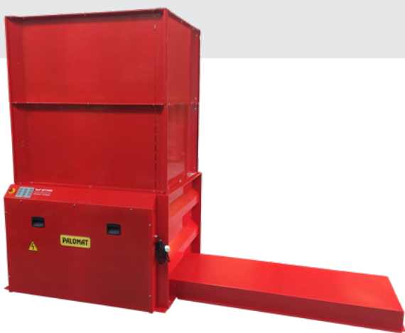
PALOMAT® with custom-made safety box