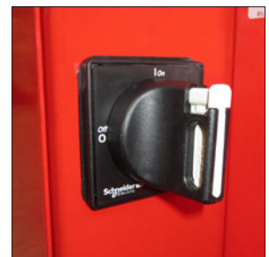
Main Isolation Switch