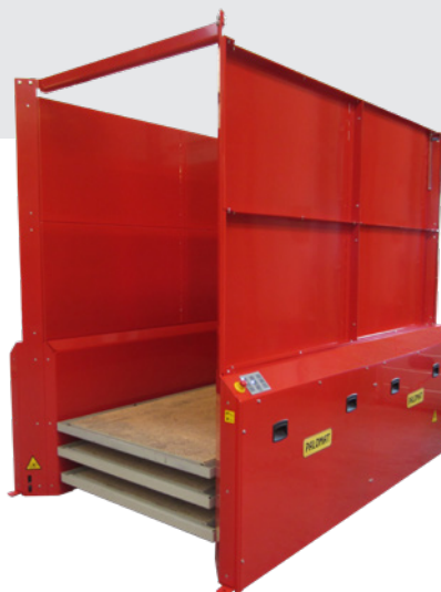
Custom-made for 2400x1200x160 mm platforms