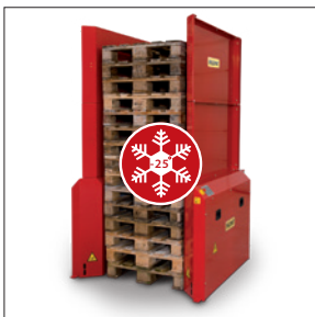
Pallet handling in cold environments down to -25 C° / -13 F° (PALOMAT® Greenline 15 pallets / 500 kg.)