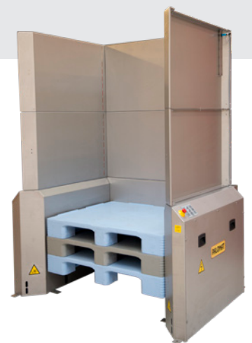
Custom-made for 1060x750x175 mm pallets