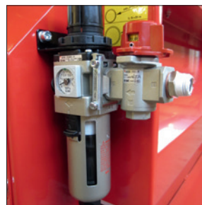
Pneumatic Isolator (Only for Air models)